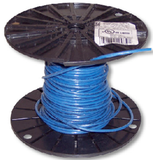
12 AWG stranded wire

A simple test antenna with a good read range can be made from inexpensive stranded copper wire used in house construction.